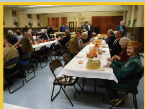
Scenes from Ladies and Awards Night