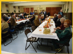
Scenes from Ladies and Awards Night